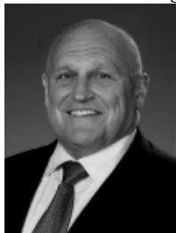
Richard L. Armitage, 63, Director since March 2006

All directors are standing for annual election this year to hold office until the 2010 Annual Meeting of Stockholders.