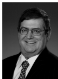
Kenneth M. Duberstein, 64, Director since August 2002