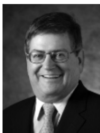
Kenneth M. Duberstein, 63, Director since August 2002