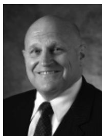
Richard L. Armitage, 62, Director since March 2006

If the proposal to amend our Certificate of Incorporation and By-Laws to provide for the annual election of directors is approved, all directors will stand for election each year beginning with our 2009 Annual Meeting of Stockholders.