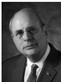
Norman R. Augustine, 72, Director since August 2002