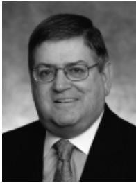
Kenneth M. Duberstein, 60, Director since August 2002