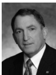
Charles C. Krulak, 63, Director since August 2002