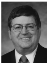
Kenneth M. Duberstein, 58, Director since August 2002