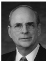
Norman R. Augustine, 67, Director since August 2002