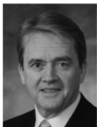
William K. Reilly, 63, Director since August 2002