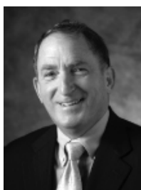
Charles C. Krulak, 66, Director since August 2002