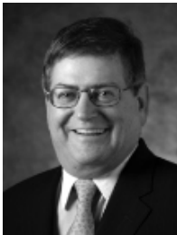
Kenneth M. Duberstein, 63, Director since August 2002