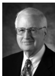
J. Stapleton Roy, 72, Director since August 2002