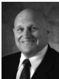
Richard L. Armitage, 62, Director since March 2006

If the proposal to amend our Certificate of Incorporation and By-Laws to provide for the annual election of directors is approved, all directors will stand for election each year beginning with our 2009 Annual Meeting of Stockholders.